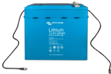
12,8V 300Ah LiFePO4 Battery

With Bluetooth cell voltages, temperature and alarm status can be monitored. Very useful to localize a (potential) problem, such as cell imbalance.